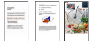
A4 Black Text memo* 1 A4 Colour Text & Graphics* 2 A4 Photo* 3

A standard USB interface ensures instant plug-and-play connectivity, while a Parallel port is also included as standard. For multiple users an optional networking solution is also available.